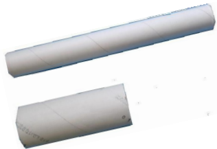
Toilet, Cellophane, paper core etc.