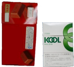
Snacks, candies, cigarettes paper pack, etc.