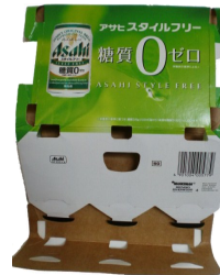
Canned Beer Package