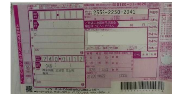
Carbon Copy Paper