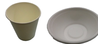
Paper Plate, Paper Cup