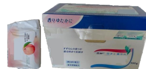
Package of soap, detergent etc.