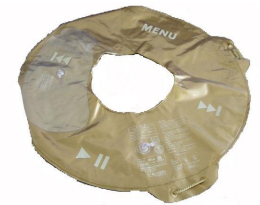
Plastic Swimming rings

This refuse is burned in an incinerator. Heat caused by burning plastics, will be utilized as power.