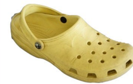
Plastic Sandals like GROCS