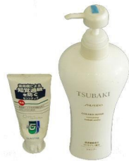
Shampoo Holders Tubes of Toothpaste

Look for this Mark. It means Recyclable Plastic Containers